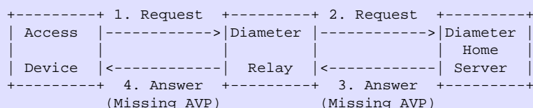
Figure 8: Example of Application Error Answer Message

Figure 7 provides an example of a message forwarded upstream by a Diameter relay. When the message is received by Relay 2, and it detects that it cannot forward the request to the home server, an answer message is returned with the 'E' bit set and the Result-Code AVP set to DIAMETER_UNABLE_TO_DELIVER . Given that this error falls within the protocol error category, Relay 1 would take special action, and given the error, attempt to route the message through its alternate Relay 3.